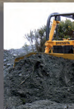
Semi-U, Full-U and Coa Angle dozer is designed of an angling dozer.