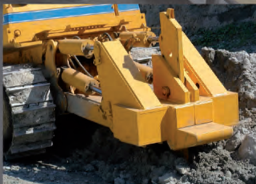
Single-shank and multi-shank rippers are equipped with hydraulic pitch.